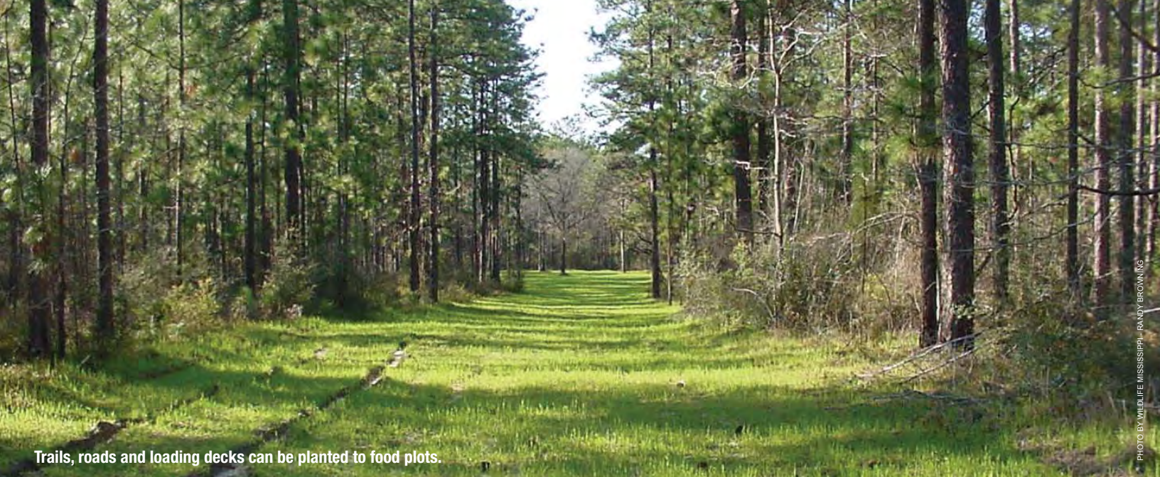
Trails, roads and loading decks can be planted to food plots.