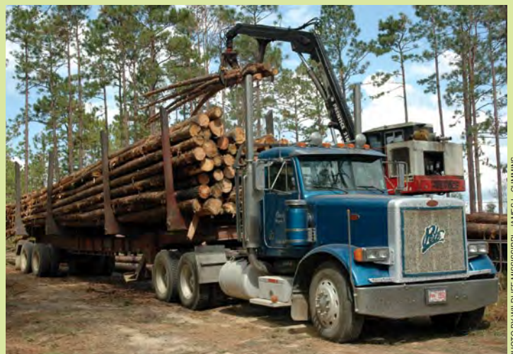
Loading decks often form the basis for food plots or grassy areas.