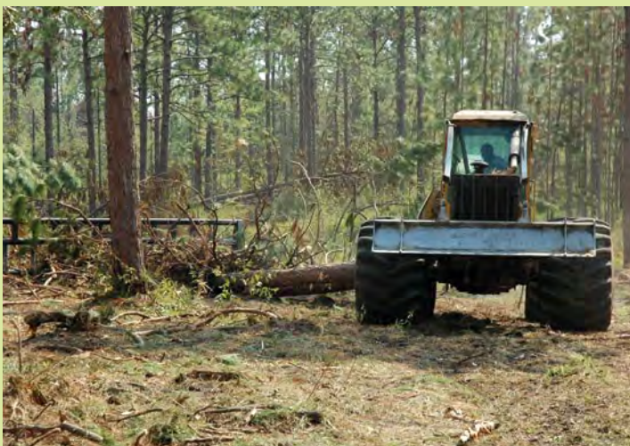
Skidder trails often form the basis for a road/trail system.

Protecting areas around streams is also highly beneficial to soil and water quality and wildlife. Unfortunately, some of the most valuable timber grows on highly-productive stream fronts and surrounding areas. Many benefits result from establishing streamside management zones (SMZs) where timber harvesting is limited. The hardwood or mixed pine/hardwood types, usually found in a SMZ, provide food and cover that are important to many species of wildlife in an area that is often fundamental to their survival. The optimum SMZ width for most wildlife is hard to determine. Very narrow zones (around 30 ft.) are used